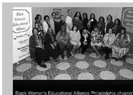
Black Women's Educational Alliance Philadelphia chapter